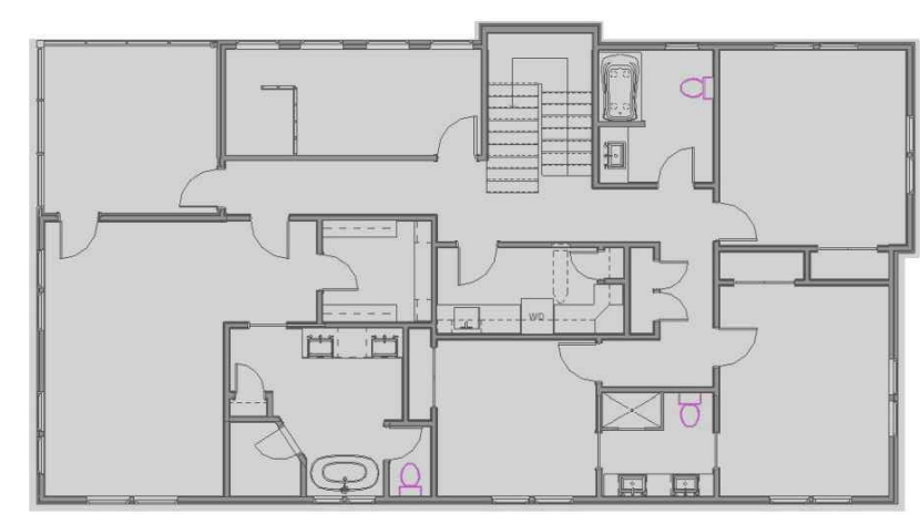
Sheet Name: UPPER LEVEL KEY PLAN

ISSUE FOR PROPOSAL ONLY Date: 14 September, 20021 Drawn by: LLF Checked by: JG Scale: 1/4" = 1'-0"