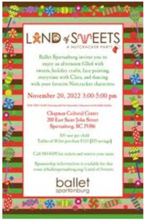
Updated the LAND OF SWEETS poster for 2022 and put on website