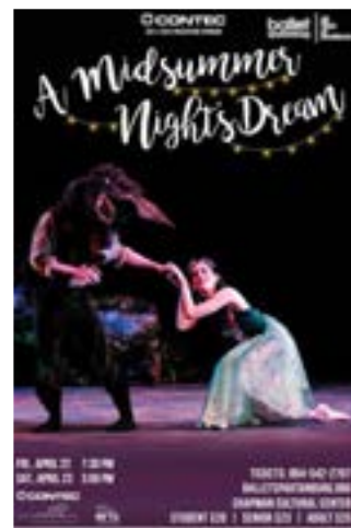
Updated Midsummer poster onto Ballet Spartanburg website