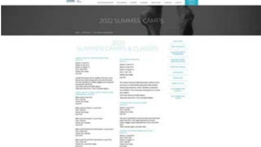
Put the 2022 summer dance camps and classes on the website, Ballet Spartanburg calendar and Chapman Cultural Center calendar