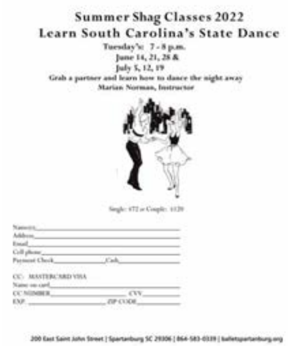
Created a page and uploaded sign-up sheet for summer shag classes