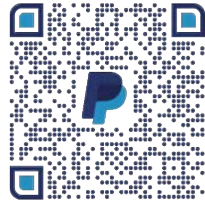
Went into Ballet Spartanburg's PAYPAL account, created a QR code for easier payment at events