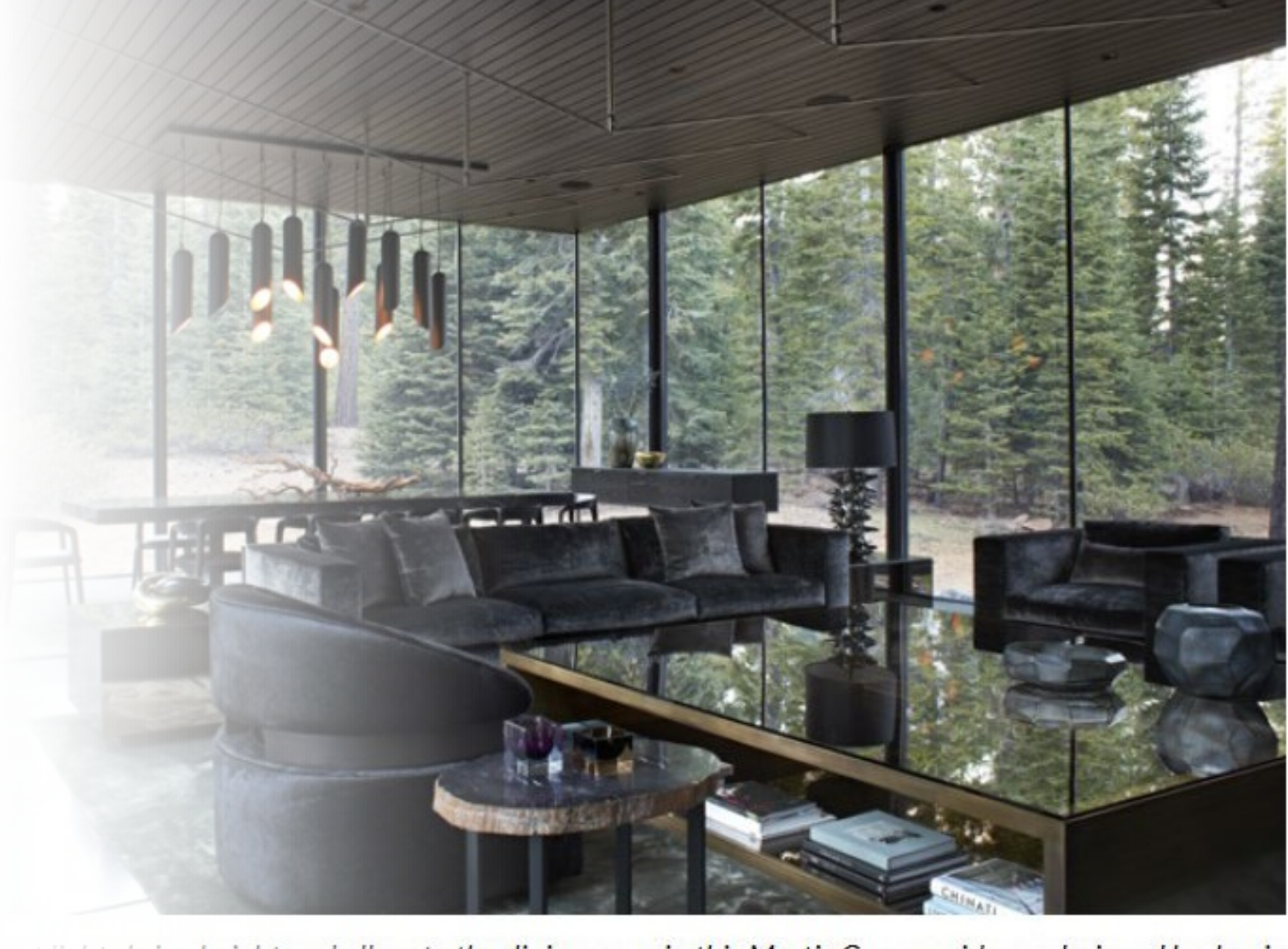
ant lights bring height and allure to the dining room in this Martis Camp residence designed by Jamie Bush