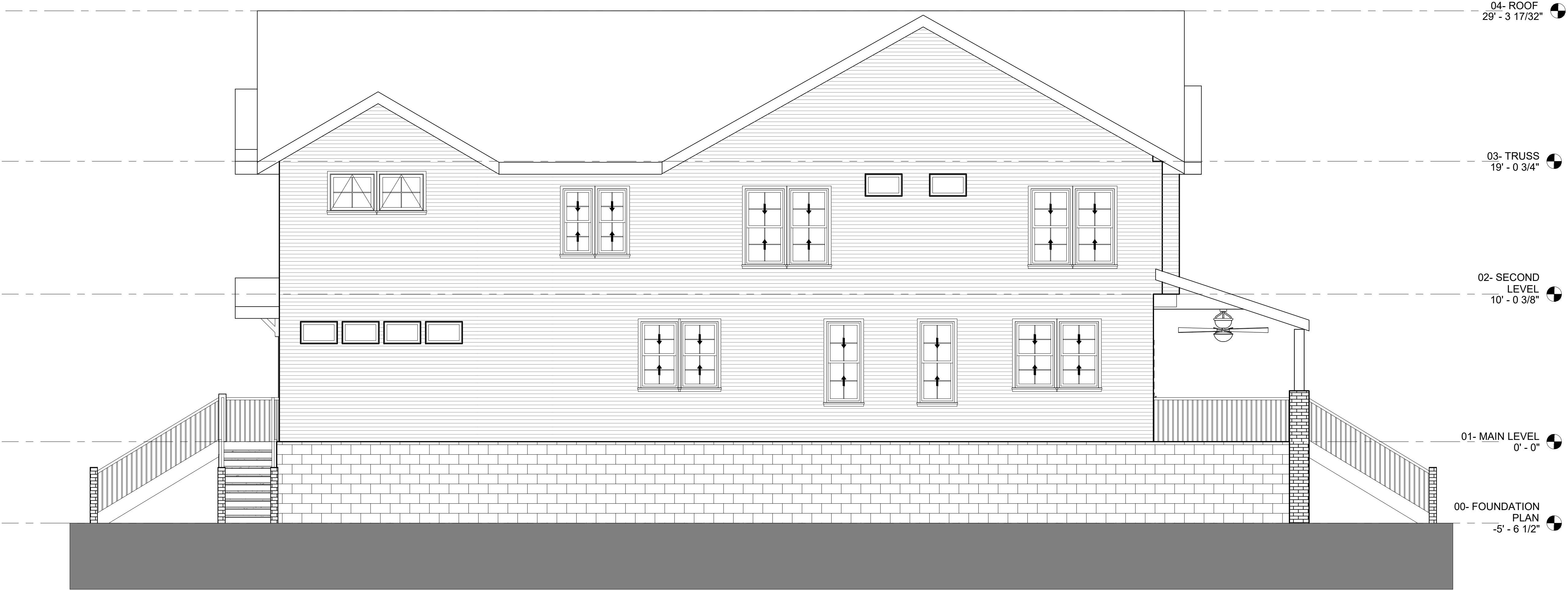
1 A10.02 EXTERIOR SECTION - SOUTH SCALE: 1/4" = 1'-0"

PROJECT ADDRESS: 1383 IVERSON ST NE ATLANTA, GA 30307