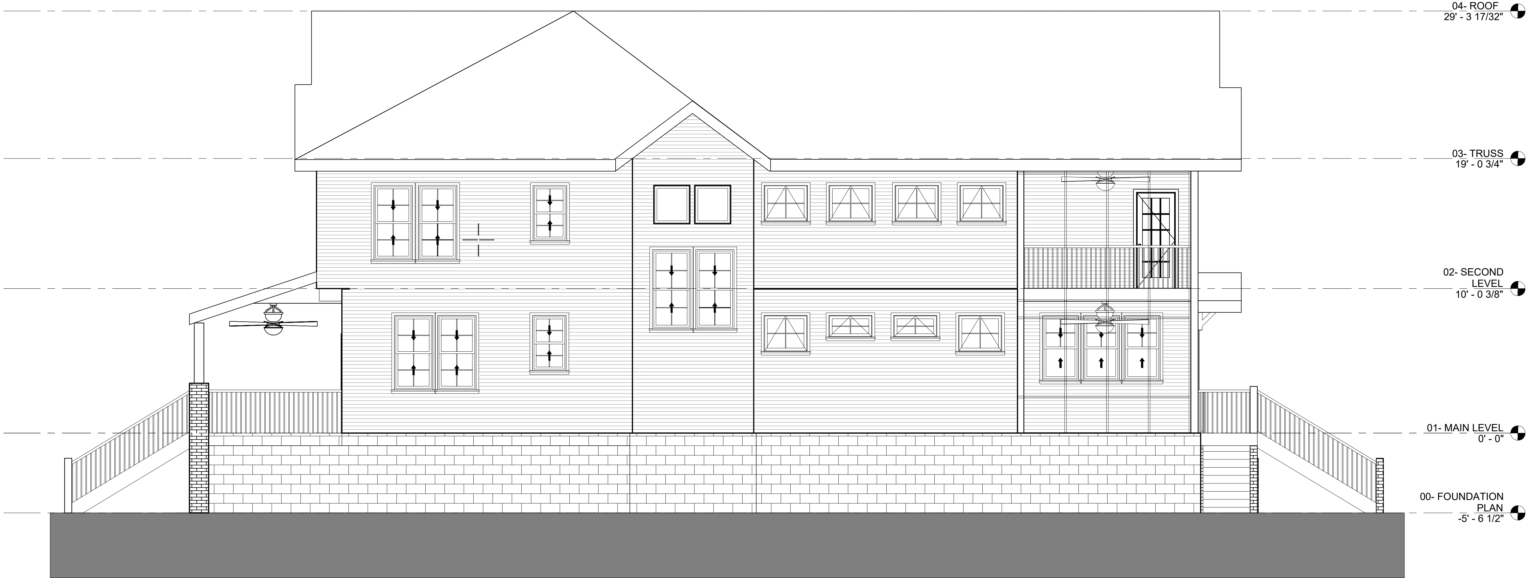
1 A10.01 EXTERIOR SECTION - NORTH SCALE: 1/4" = 1'-0"

PROJECT ADDRESS: 1383 IVERSON ST NE ATLANTA, GA 30307