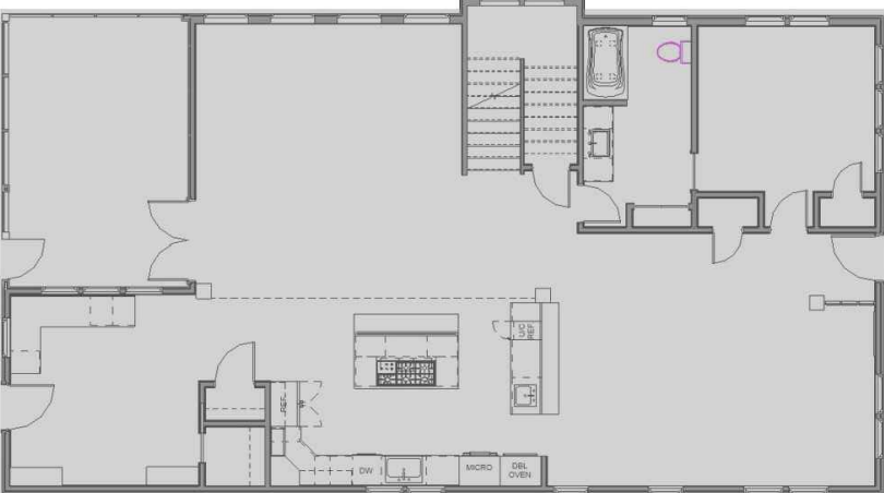
Main Level Key Plan KEY LEGEND