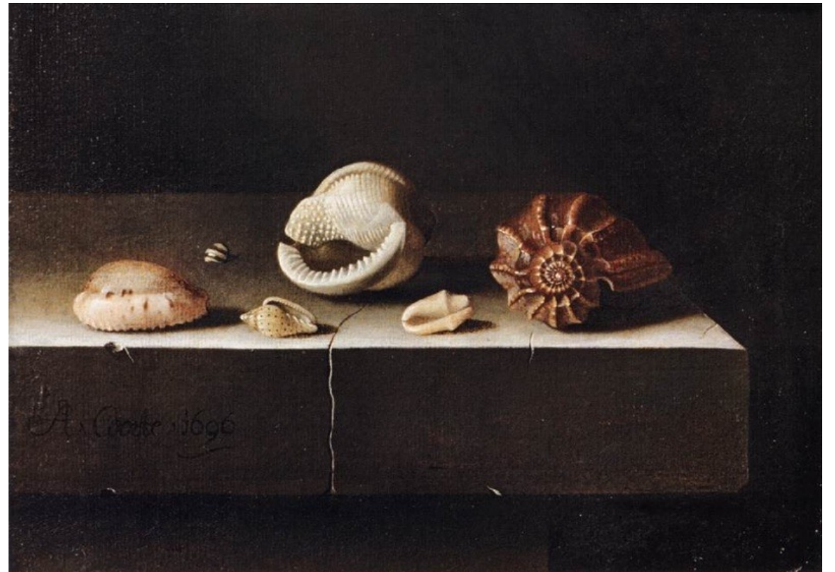
Five Shells on a Slab of Stone (1696), oil on canvas.