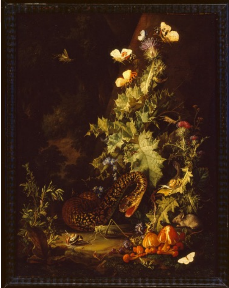
Elias van den Broeck, Still Life with a Snake , ca. 1695, oil on canvas, 62 x 53 cm. Oxford, Ashmolean Museum (artwork in the public domain)