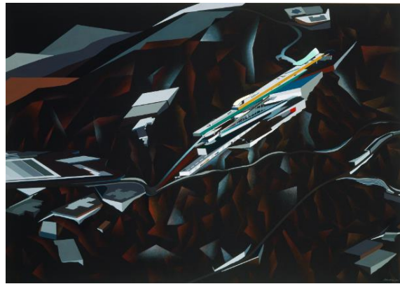
Peak Project, Hong Kong, China, Hadid 1991 ( Moma )

began working at the Office of Metropolitan Architecture and eventually taught at the Architectural Association ( Pritzker Biography ). Hadid's career truly began to gain traction when she founded her own architecture firm in 1979, Zaha Hadid Architects ( Zaha Hadid Architects ).