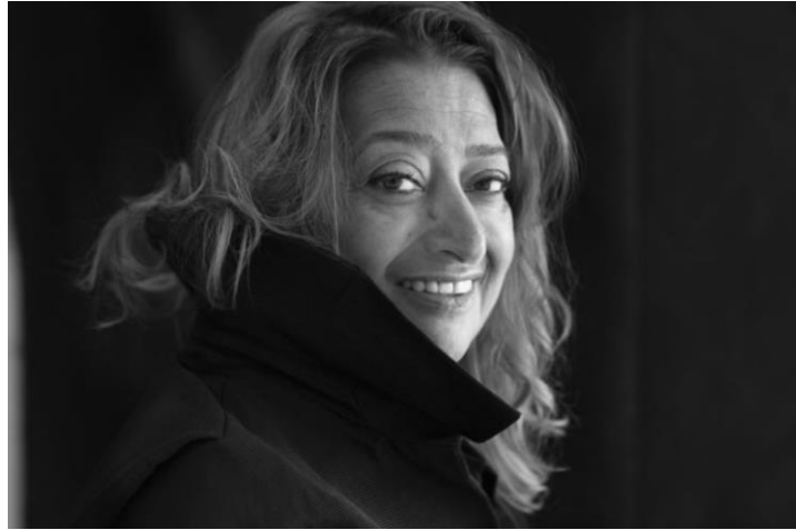
Zaha Hadid

Zaha Hadid's contributions to architecture cannot be understated. Taking inspiration from the Suprematists of the 1920s, she revolutionized modern architecture with daring angles, dynamic curves and compositions that split space. Part of the Deconstructivist movement, Hadid designed her buildings to create the illusion of structural obscurity, often with swooping bends or jutting shards. Born on October 31, 1950 in Baghdad, Iraq, Hadid went on to become one of the most influential contributors to modern architecture as we know it.