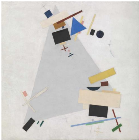
Dynamic Suprematism, Malevich 1915

to use the Suprematist style in architecture, Hadid revived these arrangements as the vision for her designs. By not using the T-square or rulers like her architect peers and instead painting and sculpting her models, Hadid created dynamic designs that took the two-dimensional Suprematist style and gave it another dimension.