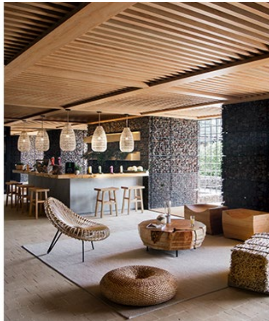
The Juice Bar and lounge area with deeply cut textures within the ceilings and lighting as well as textured, wooden furniture