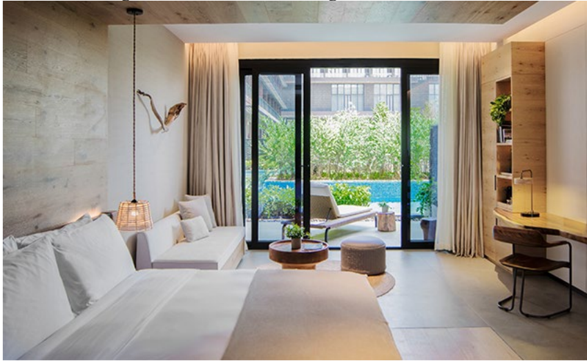
A room featuring timber wall accents, ceiling and furniture with a mix of stone flooring

The various textures used are also very natural and give off a feeling of being in amongst the Amazon Jungle. The Juice Bar lighting resembles wicker baskets and the dimension added into the ceiling just above the lighting makes it seem as though you are in a “hut.” Plants, such as succulents and Aloe, surround the Juice Bar and collect on the shelving, as well as rest on the counters.