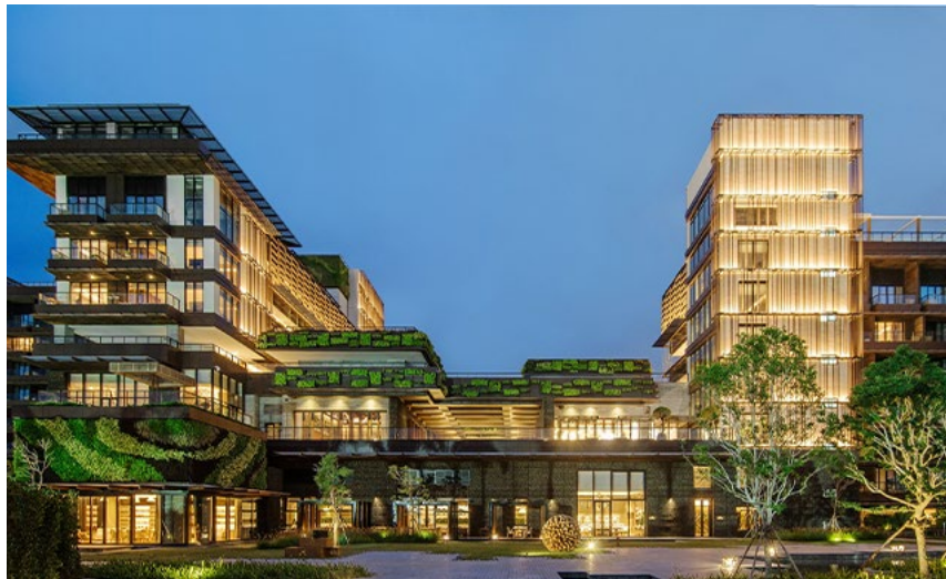
Exterior image of the resort featuring its green accents

The interior to be analyzed is 1 Hotel Haitang Bay Sanya, located on Hainan Island. It was designed by Oval Partnership and FARM studio and is the first Chinese resort constructed by 1 Hotels. It encompasses a mixture of Hong Kong and Singapore artistic features and culture in its architecture and has such a natural atmosphere to offer. I was first drawn to this project because of its exterior structure and lighting as it reminded me of a treehouse.