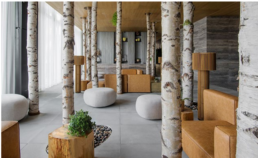
Conjoining lounge area found next to the check-in desk