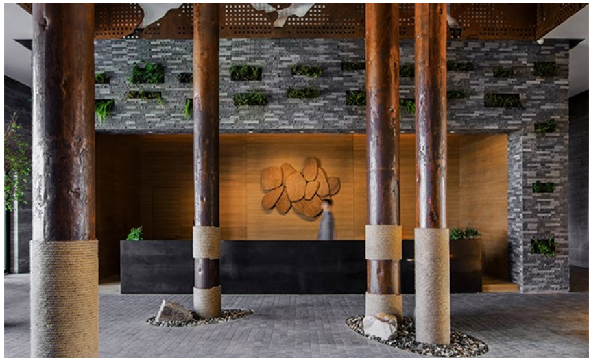
Tree trunks featured in the lobby and plants peeking through the stone wall

One of my favorite features is the incorporation of live trees in the lobby. The resort is very “green” and organic in its properties, which is evident from the use of so many natural products and resources throughout its furnishings and decoration. When we consider going on vacation, it is usually to promote relaxation and to relieve the body and mind from stress and anxiety. The use of these natural materials, as well as the geographical placement of the resort, promote relaxation, release, and renewal.