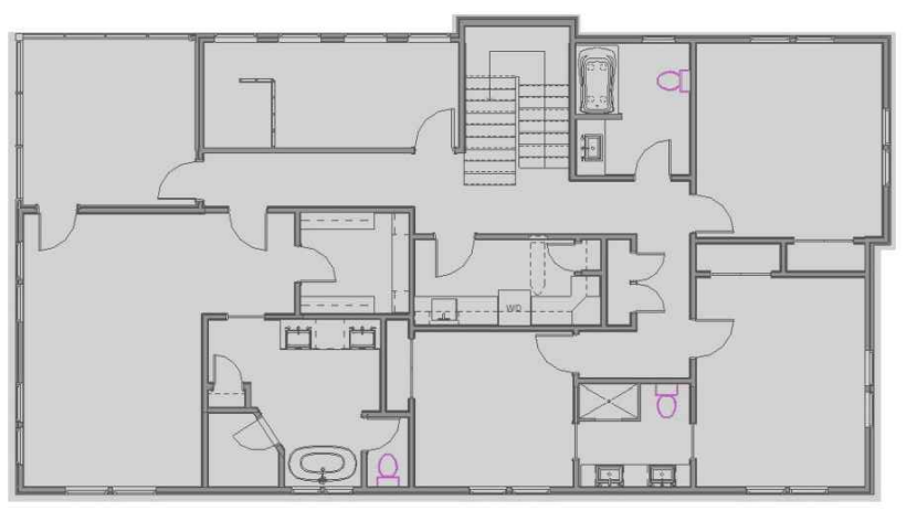
Upper Level Key Plan KEY LEGEND

Sheet Name: UPPER LEVEL POWER & SWITCH PLAN