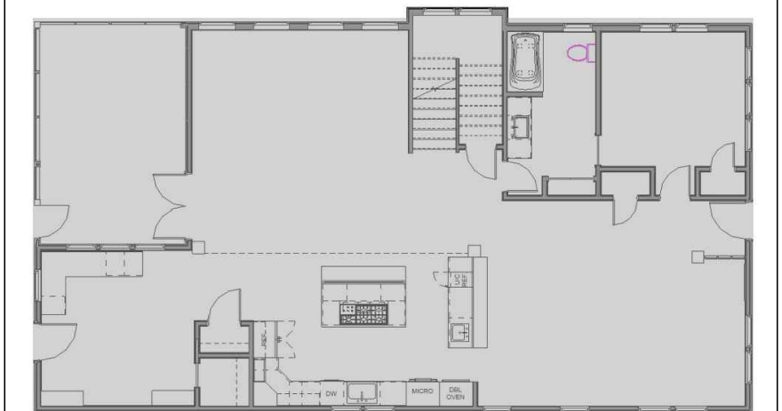
Main Level Key Plan KEY LEGEND

Sheet Name: MAIN LEVEL POWER & SWITCH PLAN