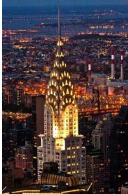
Chrysler Building, NYC