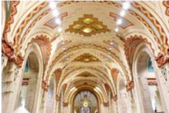
Interior of the Guardian Building of Detroit, Michigan